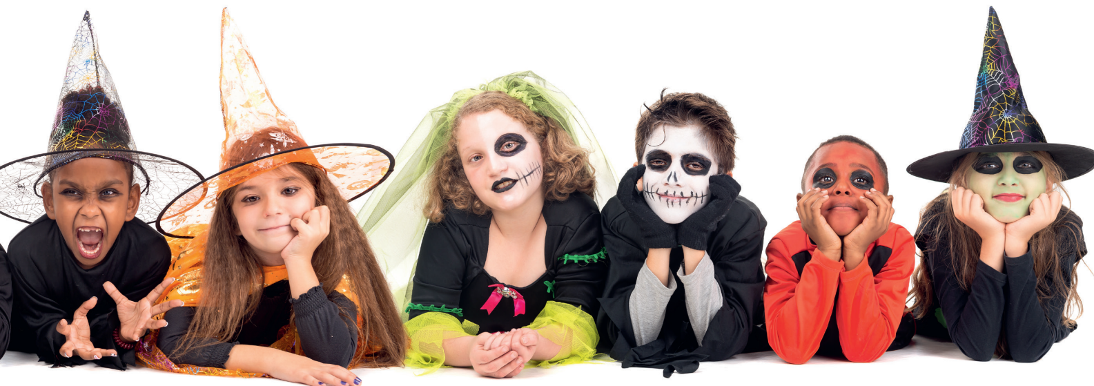
Kids dressed up in spooky costumes for Halloween.